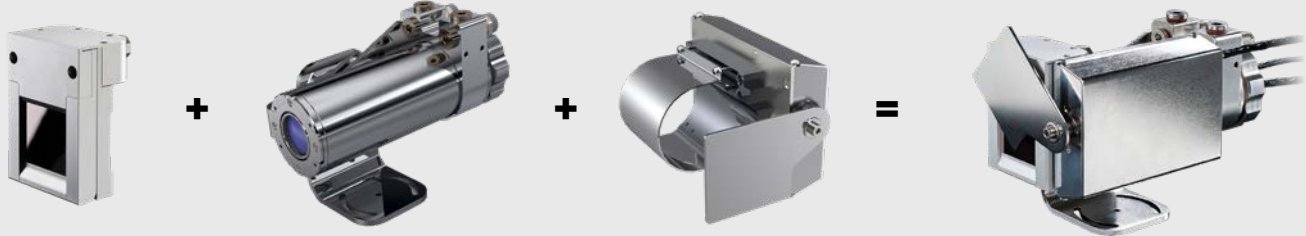
Air purge laminar