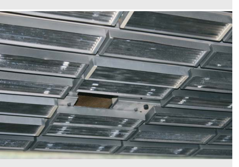
Heating field comprising radiant heaters, arranged in columns and rows. One heating field was removed for the viewing field of the camera.

The optris PI infrared camera provides the perfect solution. Its wide-area temperature measurement covering the majority of the composite fiber sheet allows both individual values such as cold spots and hot spots as well as average values and temperature profiles across the surface to be displayed.