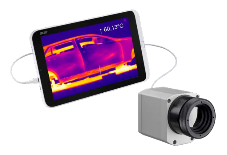
optris PI thermal imaging camera, operated via USB from a tablet PC.

80 Hz and features a high degree of customization for customer-specific adaptations.