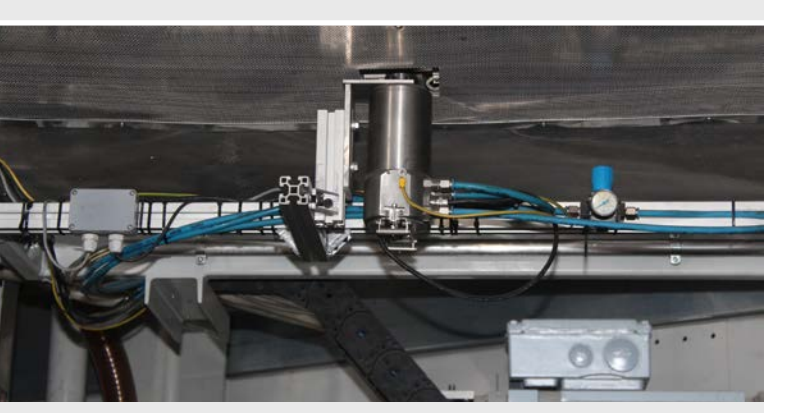
optris PI thermal imaging camera, water-cooled in industrial protective housing can be used at temperatures of up to 315 °C.

Further information on the CoolingJacket can be found at www.optris.global/accessories-infrared-cameras