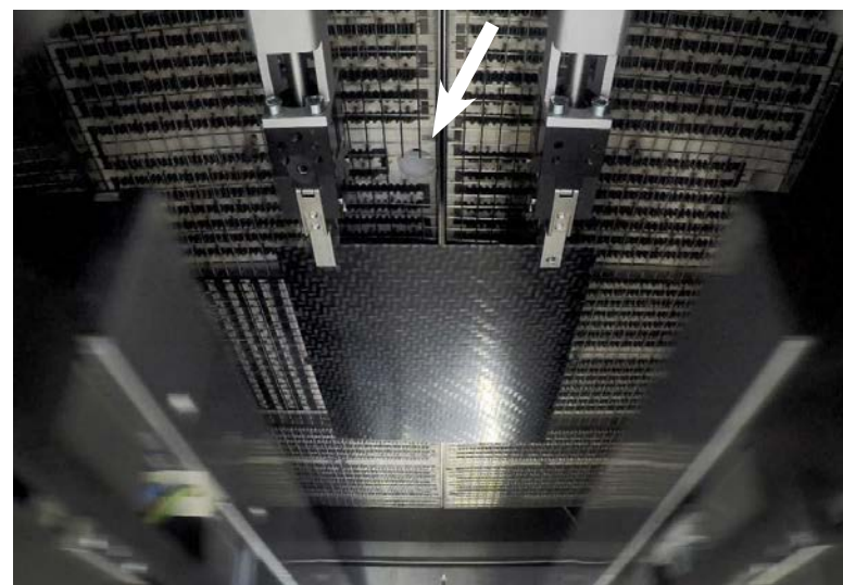
In the infrared heating system of KraussMaffei the semi-finished products are heated up to the due temperature. The infrared thermometers are located behind the recess (white arrow).

KraussMaffei has developed an infrared heating technology for this process, which guarantees homogeneous, fast heating of the organo sheets. In the standard version, up to 72 infrared ra-