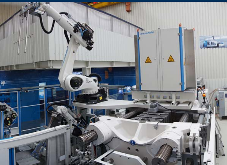
Automated manufacturing plan for the production of continuous fiber-reinforced thermoplastics.

molding machine, which is why the heating technology is fully integrated into the KraussMaffei MC6 injection molding machine controller.